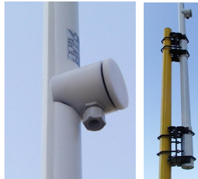
Attachment Type D

- PK-02: Connection Box for the antennas type AD-2/C-... and AD-2/D-... (see separate data sheet for the PK-02)